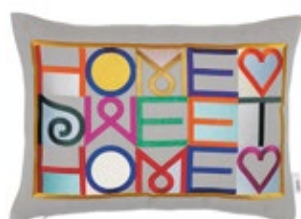
Embroidered Pillows Home Sweet Home, light grey H 300 x W 400