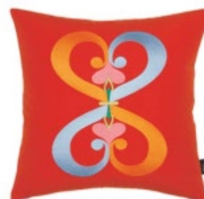
Embroidered Pillows Double Heart, rot H 400 x B 400