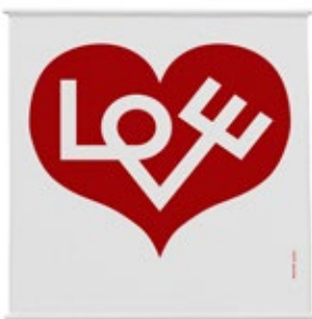
Environmental Wall Hanging