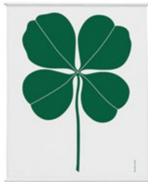
Environmental Wall Hanging