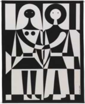
Environmental Wall Hanging