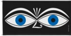
Environmental Wall Hanging