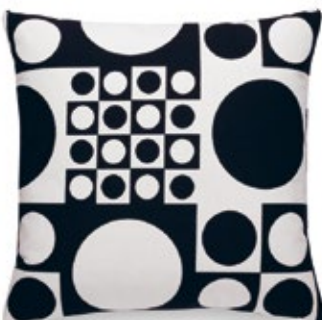
Classic Pillows Maharam Geometri black/white H 400 x W 400