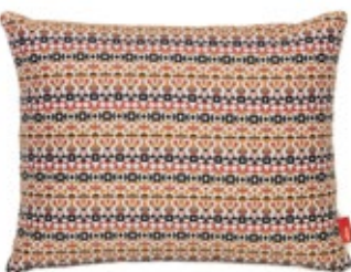
Classic Pillows Maharam Arabesque, crimson pink H 300 x W 400