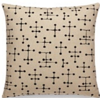
Classic Pillows Maharam Small Dot Pattern Document H 400 x W 400