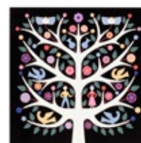
Graphic Wall Panel, Tree of life, black