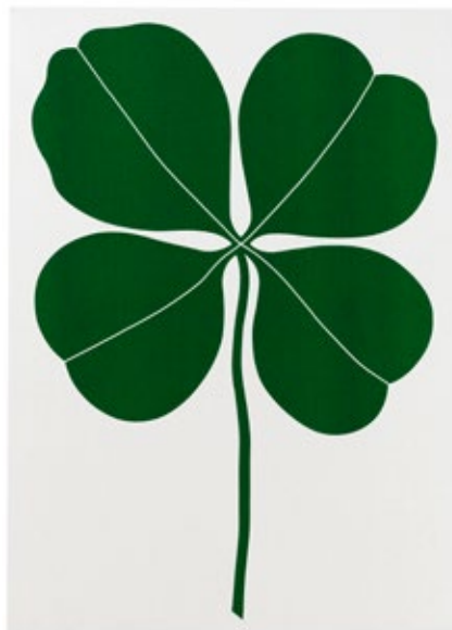
Environmental Enrichment Panel