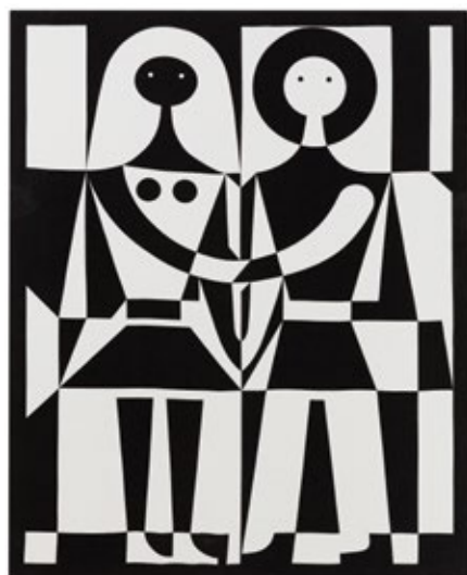
Environmental Enrichment Panel