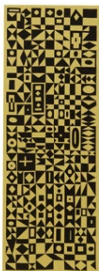
Environmental Enrichment Panel