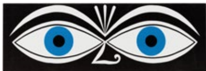
Environmental Enrichment Panel